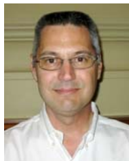
Curtis Hall By Letter